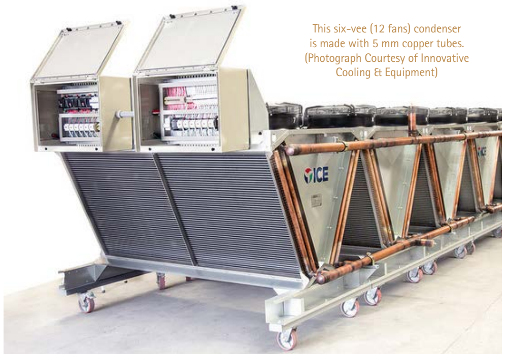
This six-vee (12 fans) condenser is made with 5 mm copper tubes.