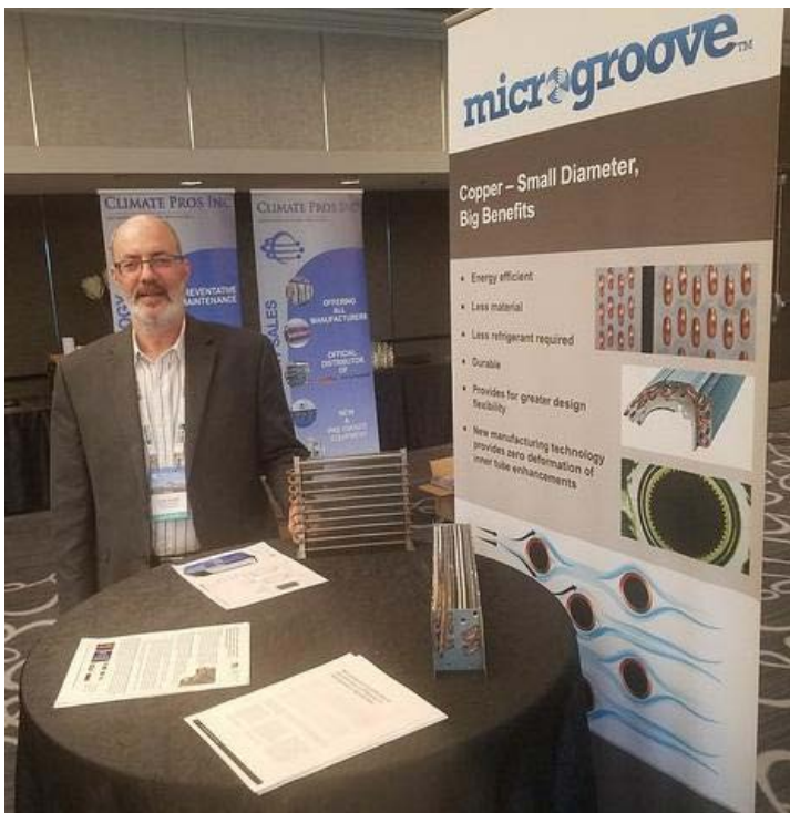
MicroGroove was on display at the 2018 ATMOsphere America Conference. Smaller-diameter copper tubes allow for the safe and efficient use of R290 in eco-friendly refrigeration equipment, a major success for MicroGroove in the Americas.

This article surveys trends in the adoption of MicroGroove in three regions of the world including the Americas, Europe and Asia. Already MicroGroove is being adopted at an accelerated pace in every corner of the world.