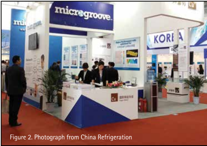
Figure 2. Photograph from China Refrigeration

Despite the winter storm in New York City coincident with the AHR Expo, the show was well attended and interest in MicroGroove was high at the Javits Center. Visitors to the MicroGroove booth expressed interest in using MicroGroove for a wide range of applications including refrigerated transport, R744 coils and commercial and industrial applications, where the smaller diameter copper tubes offer higher efficiencies, compactness and reduced refrigerant volumes as well as excellent durability.