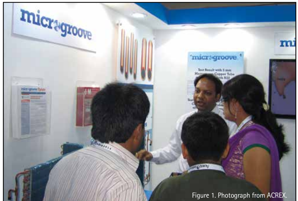
Figure 1. Photograph from ACREX.